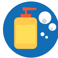
Not washing hands