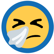
Coughing and sneezing

Similar to how influenza and other respiratory illness are spread, COVID-19 may be spread from an infected person to others by: