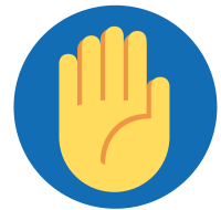
Touching your mouth, nose, or eyes