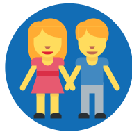
Close personal contact