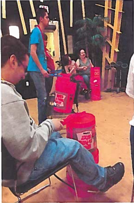
Another at Family Band